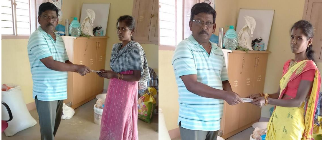
SHG members receiving the loan cheque.