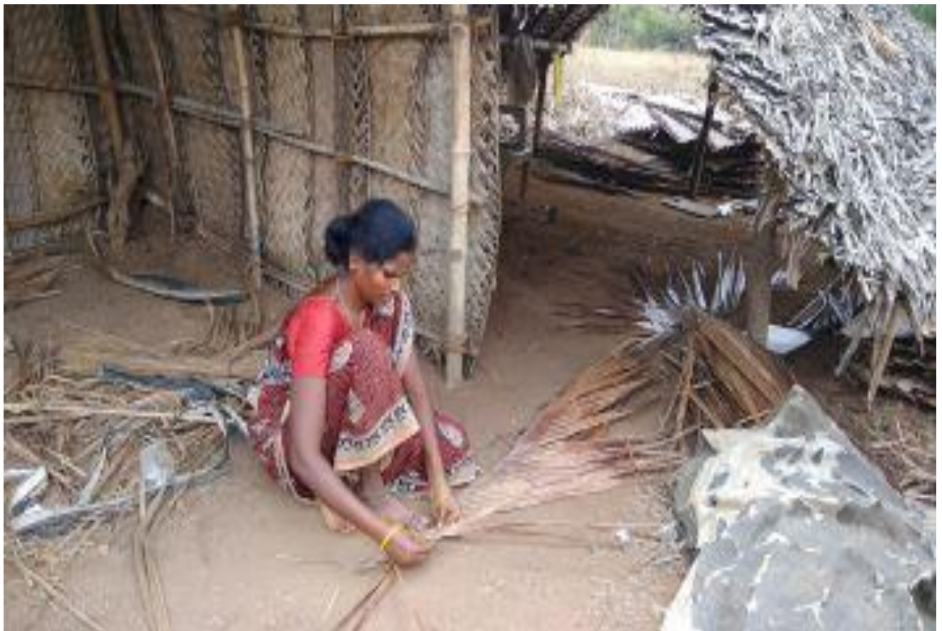
SHG member at work.