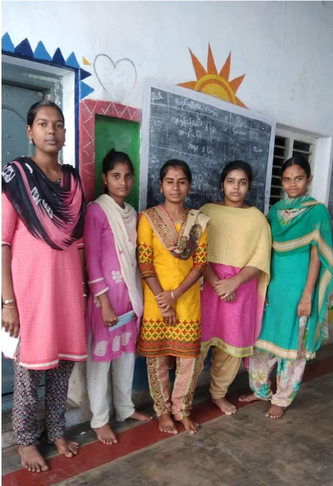
The College students from 2021-2022 who studied with a scholarship.